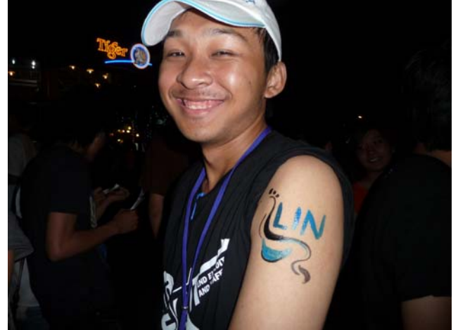
A young, brave visitor to LIN's booth